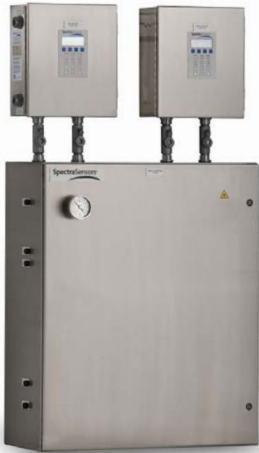
2-Pack Analyzer System with Heated Sample Conditioning and Pressure Regulation

Training requirements are reduced and the system enables fewer electrical runs, fewer sample runs and less labor. Installation and operational costs are dramatically reduced.